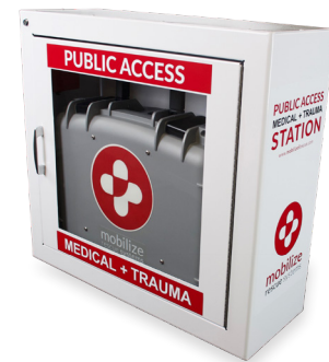
Alarmed wall cabinets available.

All the medical supplies are clearly labeled, logically organized, and color-coded to match the instructions in the Mobilize Rescue app. This system's intuitive organization makes locating supplies easy, saving valuable time during an emergency.